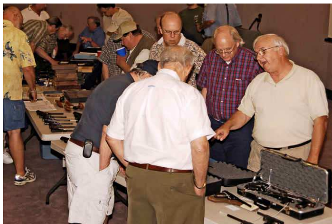
The ‘Goods’ on display