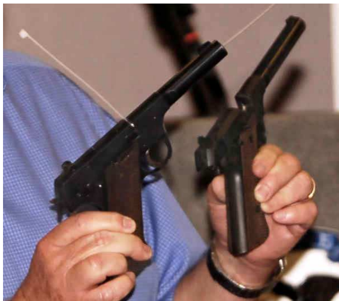
A pair from the Hurst Collection